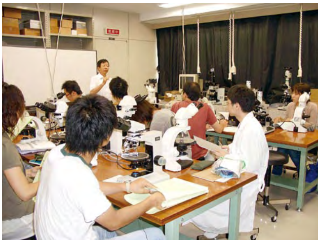
Snapshot in the course

were given a chance to observe real specimens to enrich their understanding of taxonomic groups. During the morning of the third day, there was special lab training and a Q&A session. We hope that when students and researchers are back in their respective organizations, they will be able to explain to others what they have learned, for example, what an XX microfossil actually is. In cooperation with about a dozen micropaleontologists from all over Japan, the school offered the opportunity to study foraminifera, calcareous nannofossils, radiolaria, diatoms and ostracoda. Discussions are currently in progress as to the possibility of letting different universities take turns in hosting the school.