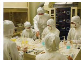
Snapshot in the course

are waiting for enthusiastic graduate students and researchers to participate in this course.