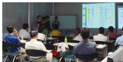
Snapshot of presentation

In the afternoon of both days, participants formed groups of 3 to 4 to practice reading in and interpreting data. Using data obtained by ODP and IODP, the participants made extensive use of the knowledge they had just