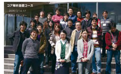
Group photo on March 2009