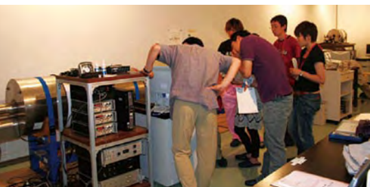
Snapshot on August 2008

As IODP considers paleomagnetic measurements an important part of the non-destructive measurement routine, any expedition will definitely have researchers in this field onboard. The first thing expected of an onboard paleomagnetism researcher is to determine the magnetostratigraphy of core. The next steps are to develop a research strategy based on the measurement results obtained onboard, take samples using U-channels or the like, and follow this up by more