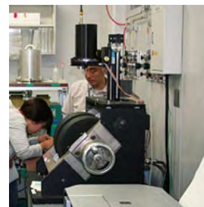
Vibrating Sample Magnetometer (VSM)

The course, a three-day school for novice students and other young talent interested in paleomagnetism, comprised lectures delivered by a number of experts and training in measuring actual samples, and is planned to be held every other year (next in the summer of 2010). It is hoped that the course will motivate students and young researchers to take up onboard and marine core research within the IODP framework.