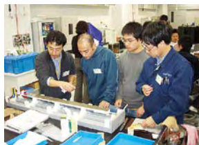
Participants learning basic visual core description