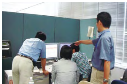
Snapshot of the course

The introductory logging course deals with geophysical logging, a method used to obtain rock property values, for example, when the core recovery rate is low. Its objective is to introduce students to the basics of logging by providing them with basic knowledge of the tools and measuring methods used in standard logging, and letting them practice data analysis using real data and software. The first school session held for two days in July 2008 had 12 participants, the majority of them post-graduate students. It is planned to continue this program on a once-a-year basis.