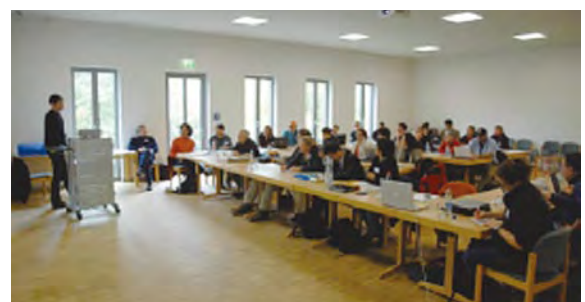
Snapshot of lecture on 2008

http://www.icdp-online.org/ http://www.j-desc.org/m3/coreschool/ICDP_drilling.html