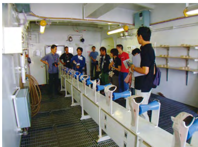
Photo at Chikyu Onboard Research School on 2008.

In this 3rd edition of the J-DESC newsletter, we would like to introduce you to the courses held up to now by the J-DESC Core School, one of J-DESC's key approaches to the development of young researchers, and let you listen to the voices of those who participated in these courses. Please also note that, in addition to the courses held so far, J-DESC is always willing to examine proposals on lectures/courses related to drilling earth science that can