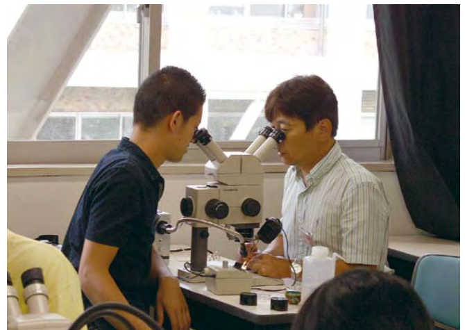
Man-to-man style lecture by specialists