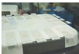
Smear Slides being prepared by participants

continental drilling core. Up to now, more than 100 young researchers and students have participated in the courses and are now practically applying their newly gained knowledge and techniques to their respective research tasks.